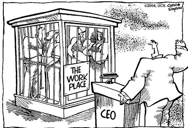
"Isn't it wonderful that America gives people like me the right to speak freely."

Personally, the most crushing blow of this election was losing the Governor's seat and a Democratic Statehouse majority in Indiana. Unlike our neighbors to the west, once you get outside of Lake County and the city of Indianapolis, Indiana is basically a Republican state. The